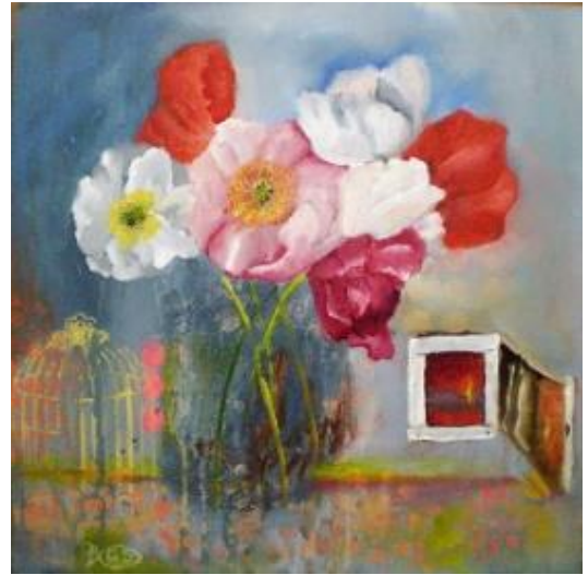
Painting by Gerda Smits

The Western Suburbs Art group was established in mid-2019. It normally meets on the 2nd Friday of the month from 12.15 until 2.15 pm in the Khandallah Town Hall upstairs lounge. The meeting ends with coffees at a nearby cafe.